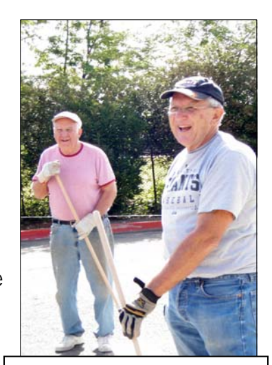
Kiwanis Club of Carmichael Volunteers

Partnerships can also help the district leverage resources and maximize use of the facilities. Staff will determine direct costs of operating programs and/or facilities. With this information the district can then determine appropriate and reasonable fees to help maintain these programs and facilities. It is imperative that we create policies, procedures, and fees that define our relationships with our regular user groups and partnerships.